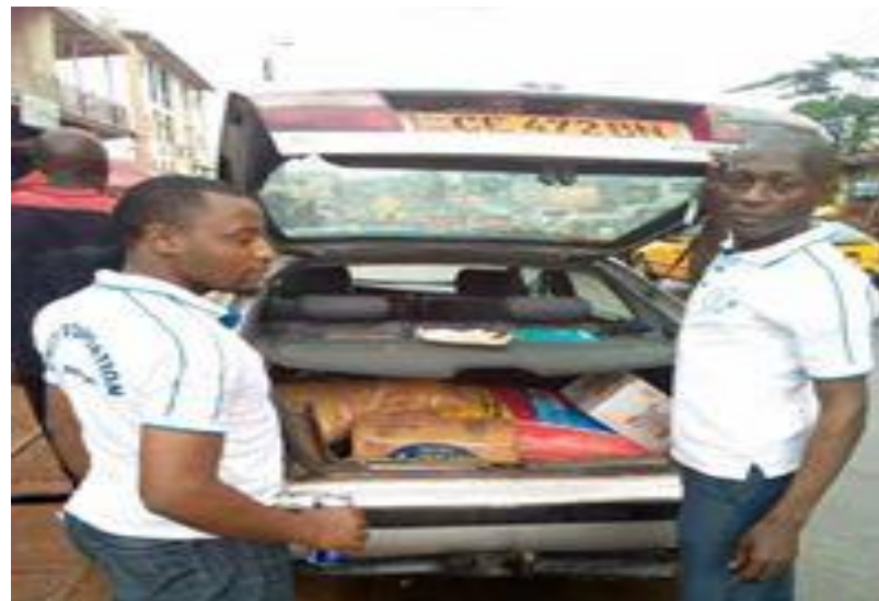
UFC Team on a food delivery mission at the Yaoundé Central Prison, December 2019

This project has, most of the times, been successfully executed thanks to the commitment of the members and volunteers of the Foundation. Nonetheless, UFC today benefits from the assistance of partners and donors such as the Committee to Protect Journalists (CPJ), Makongo Family and Charity (MAFAC), Cameroon Community in Berlin, Friends of Liberty in the United Kingdom, Society of Southern Cameroonians in Hampshire, Mezam Community in the US, and the Manyu Health and Humanitarian Services.