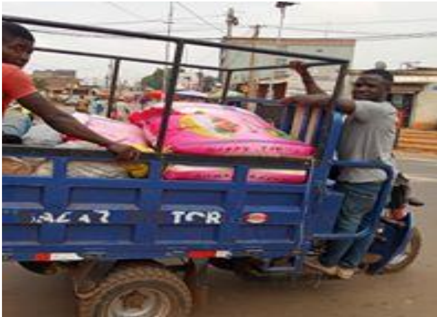
UFC team on a food delivery mission to the Yaoundé Central Prison, Cameroon, January 2020

In Douala, Bamenda, Buea and Yaoundé Central prisons, the Foundation has been able to reach out to five hundred (500) inmates with food and basic needs thanks to the fruitful collaboration of its partners such as the Committee to Protect Journalists (CPJ), the Makongo Family and Charity (MAFAC), the Friends of Liberty, UK, English Cameroonians in California and in Germany and many others.